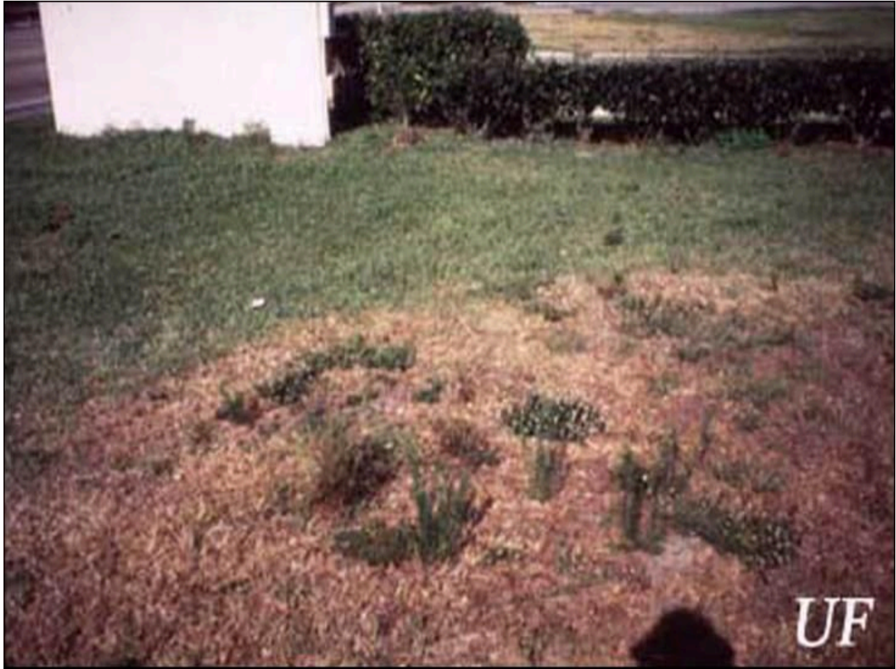
Figure 2. Damage to turfgrass caused by the southern chinch bug, Blissus insularis Barber.

Augustinegrass cultivated on high, dry, sandy or shell soil is especially vulnerable to southern chinch bug damage (Wilson 1929).