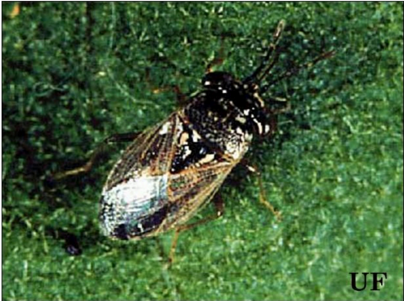
Figure 4. A bigeyed bug (Hemiptera: Lygaeidae: Geocorinae).