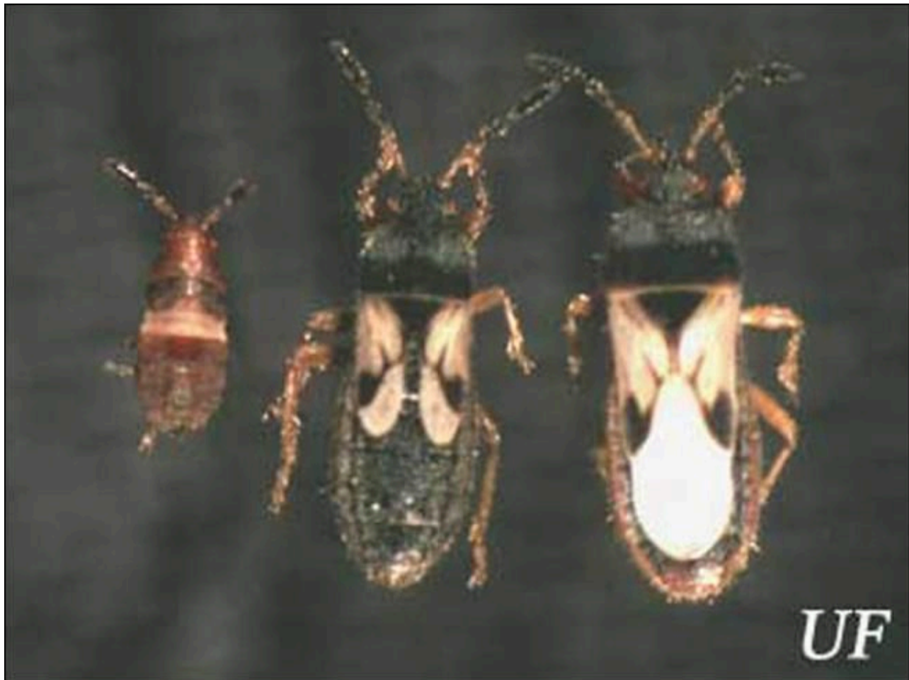
Figure 1. Nymph (left), and the short-winged (center) and long-winged adult forms of the southern chinch bug, Blissus insularis Barber.